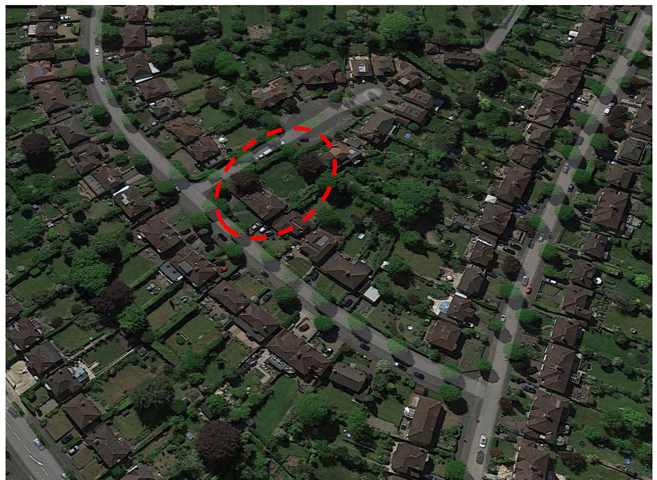
Figure 1: Aerial street view highlighting the proposed site within the surrounding streetscene