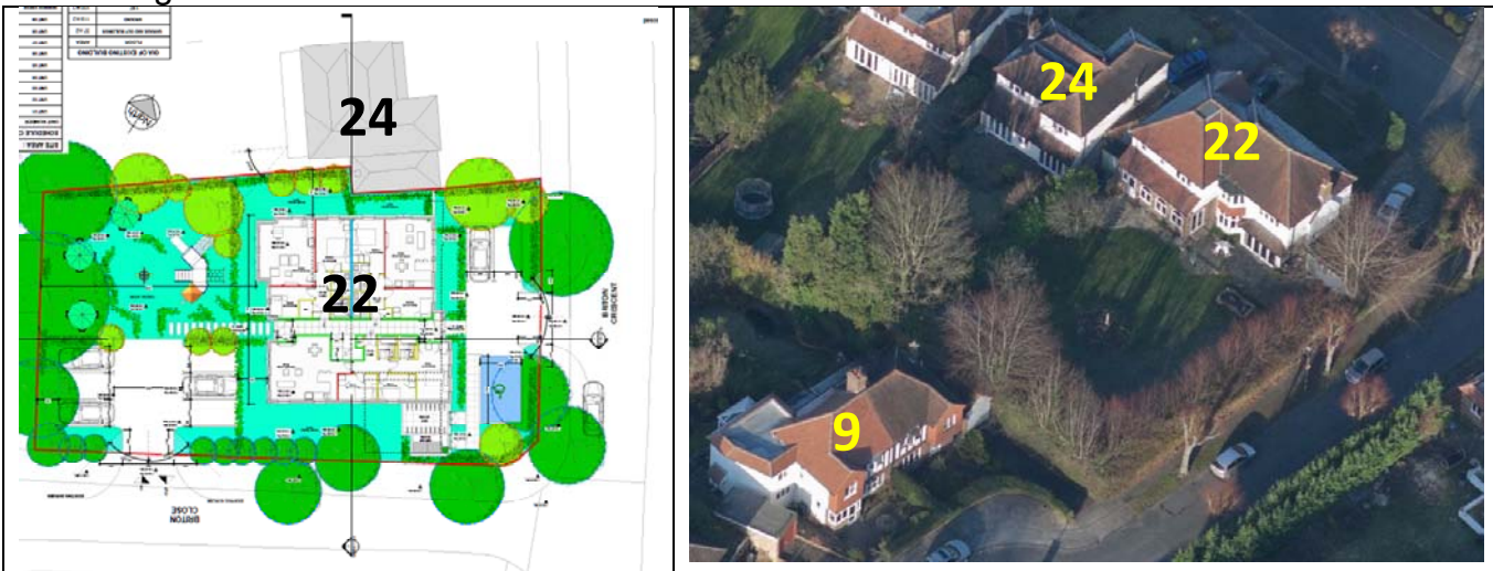
Figure 5: Plan and photo to highlight impact on 24 Briton Crescent

prudent to condition obscure glazing to ensure that any future overlooking is mitigated along the flank elevations.