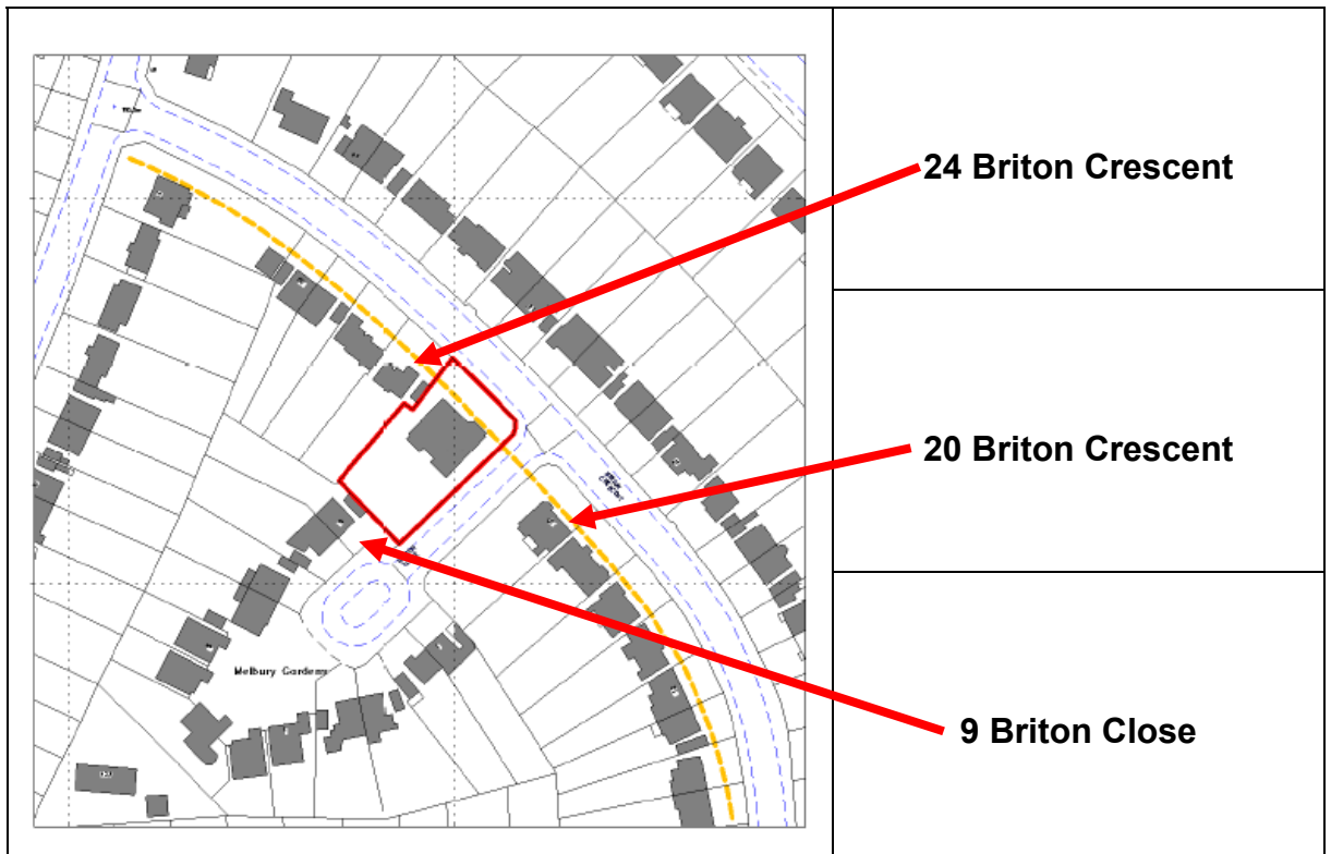
Figure 4: Ground floor plan highlighting the relationship with the adjoining occupiers.