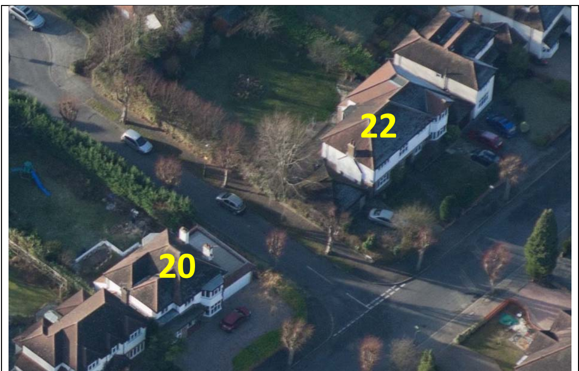
Figure 6: Photo to highlight the relationship between the application site and 20 Briton Crescent