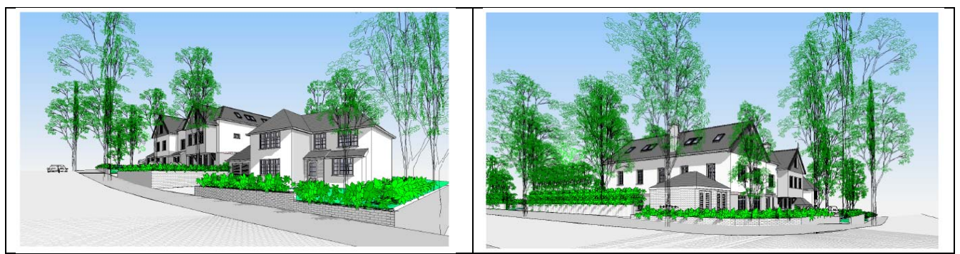
Figure 2: 3D views of the proposal from the streetscene

8.10 Generally, the materials specified are in-keeping with the character of the area which is predominantly a 1930's suburb. The design of the building incorporates a traditional styled appearance, albeit using more contemporary materials, consisting of two gables to the front elevation and pitched roof forms and appropriate materials (face brick including decorative brick courses, white uPVC framed windows, interlocking double plain grey tiles and render which can be secured through a condition) with an adequate balance between brick and glazing and appropriate roof proportions.